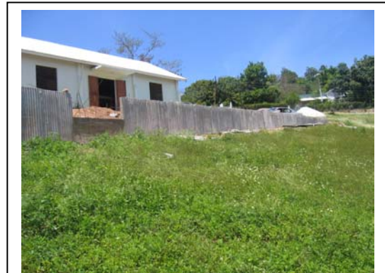
Albion Heights Basic School